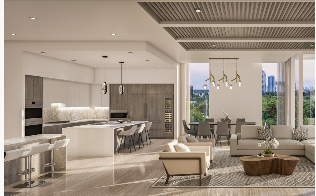
Above: Generously-proportioned kitchens and great rooms feature wet bars with quartz countertops. Below: Private entry foyer, open-concept kitchen with adjoining wet bar and grand master suite.

Private elevators with controlled access ensure the utmost in discretion. A full suite of professional-grade Wolf® and Sub-Zero® kitchen appliances bear witness to memorable social gatherings. Floor-to-ceiling, triple-panel, impact-resistant glass doors and windows preserve an environment of quiet, sumptuous comfort. Outfitted with double walk-in closets, free-standing soaking tubs, glass-enclosed showers and European double-vanities, grand owner's suites are private sanctuaries of refinement and relaxation. Set to raise expectations for well-appointed waterfront living, here, ocean-inspired elegance reigns supreme.