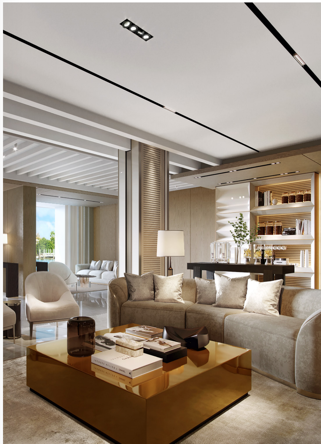
In the waterfront lounge, maritime-inspired materials and a refined palette of colors exude a relaxed aura of coastal calm for residents and guests.

In tandem with the distinguished courtesies of anticipatory service, this suite of masterfully-choreographed amenities not only accommodates, but elevates most any desire; transforming comfort and convenience into an exceptional experience in living.